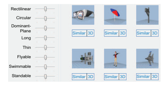
Figure 1: Part of the user interface of our 3D object retrieval system. On the left part, the user clicks the attribute bars to describe targeted objects in mind. After each click, a search is triggered and results are shown on the right. The user can also click the "Similar" button under an object to search for similar objects in the database. The "3D" button is for viewing the a 3D object from different angles.

part of the UI in real time (the ranking procedure is explained in Section 2.2).